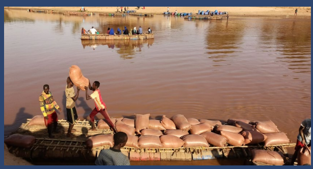
Sacks of beans being offloaded from a raft from Ethiopia on the Kenyan side of Helle Suuf crossing of the River Daua, early in the morning, 11 January 2024.

At the same time, karetas are not subject to serious scrutiny at border posts, which renders them vulnerable to misuse. In 2024, for example, donkey carts were used by al-Shabaab to carry out terror attacks in two different locations, which may lead to greater scrutiny in future, curtailing trade.<sup>42</sup>