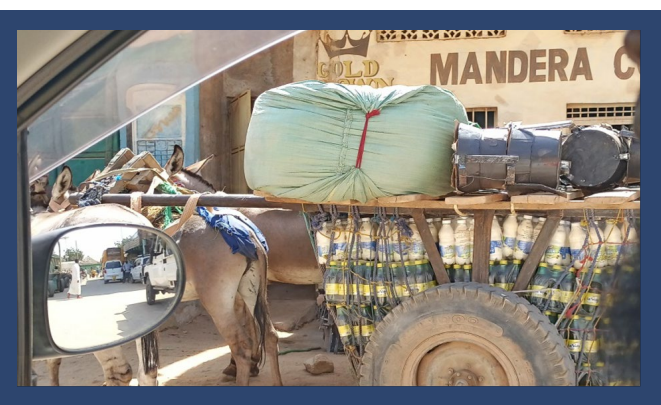
A donkey cart (dameer gari or kareta) laden with goods from Somalia at a market in Mandera, 7 January 2024.

The Donkey cart is indispensable for the Mandera triangle's mix of formal and informal trade. Referred to as kareta or dameer gari in Somali language, donkey carts can carry up to 50 50 kg bags of sugar or cement. Their easy maintenance and minimal operational cost suit the small-scale nature of the cross-border trade, including for women traders. One female kareta operator explained: 'I have used this kareta to raise my children and pay their fees. ... In one day, I get between KES 500–1,000 [USD 3.85–USD 7.70], depending on the business'.<sup>41</sup> While their main role is to transport goods across the border, donkey cart operators also purchase goods for traders, effectively serving as both intermediaries and brokers. In addition, donkey cart operators handle rent-seeking police officers at border crossings and engage with other levels of authority, such as Mandera municipal revenue officers. Even though many women own such donkey carts, they normally hire men to operate them. These men serve both the menial role of loading and unloading the karetas .