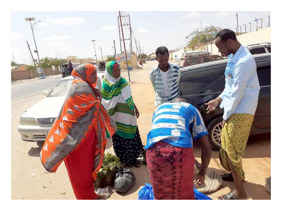
Khat sellers speak to their customers in Galkayo.

Having their own source of income can give women freedom and independence. In other economic sectors, such as livestock, agriculture or fishing, female business owners may turn the running of the business over to their male relatives following its expansion, leaving them in charge of more minor activities and responsibilities. In the khat business, by contrast, women are often fully in charge, albeit rarely over the whole business chain—distribution and the transfer of profits into other trades is generally still the preserve of male business partners or relatives.