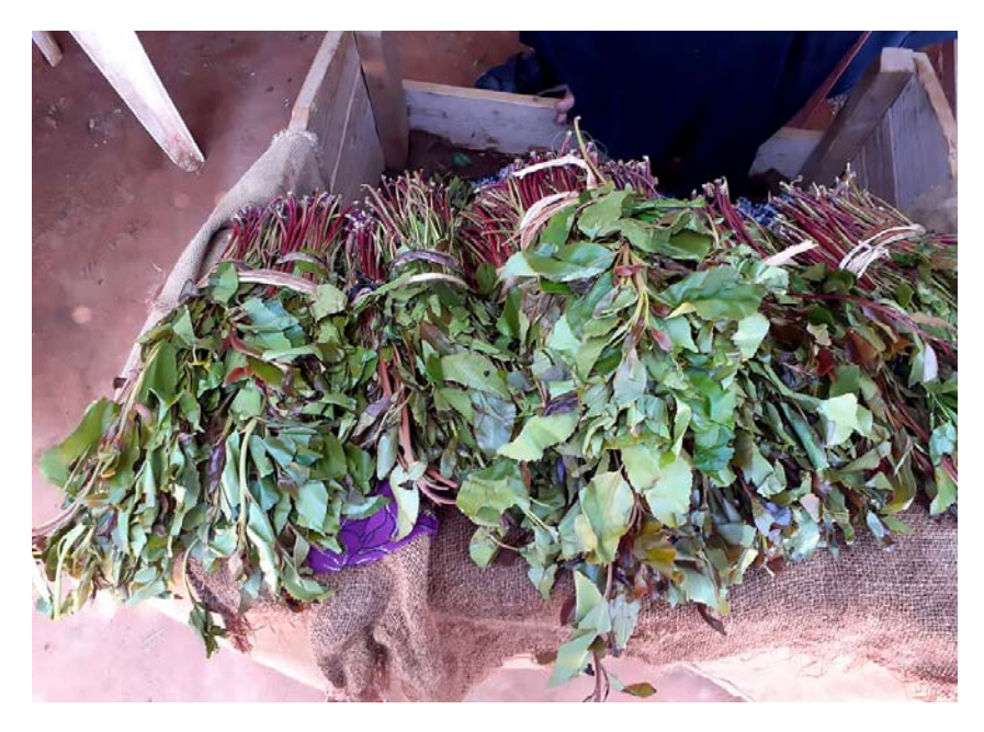
Khat bundles ready for sale in Galkayo.

Khat (also known as qaad or jaad in Somalia) is embedded in Somalia's economy and the social life of Somali men in particular. According to data compiled by the World Bank, khat is Somalia's second largest import after sugar.<sup>5</sup> This is an indicator both of khat's ubiquity across Somalia and of the khat trade's structure, which involves leaves being brought daily into Somalia by land and air from neighbouring countries, where the khat is cultivated.<sup>6</sup> In Puntland specifically, the khat business contributes approximately USD 8.5 million to the state's annual tax revenue.<sup>7</sup>