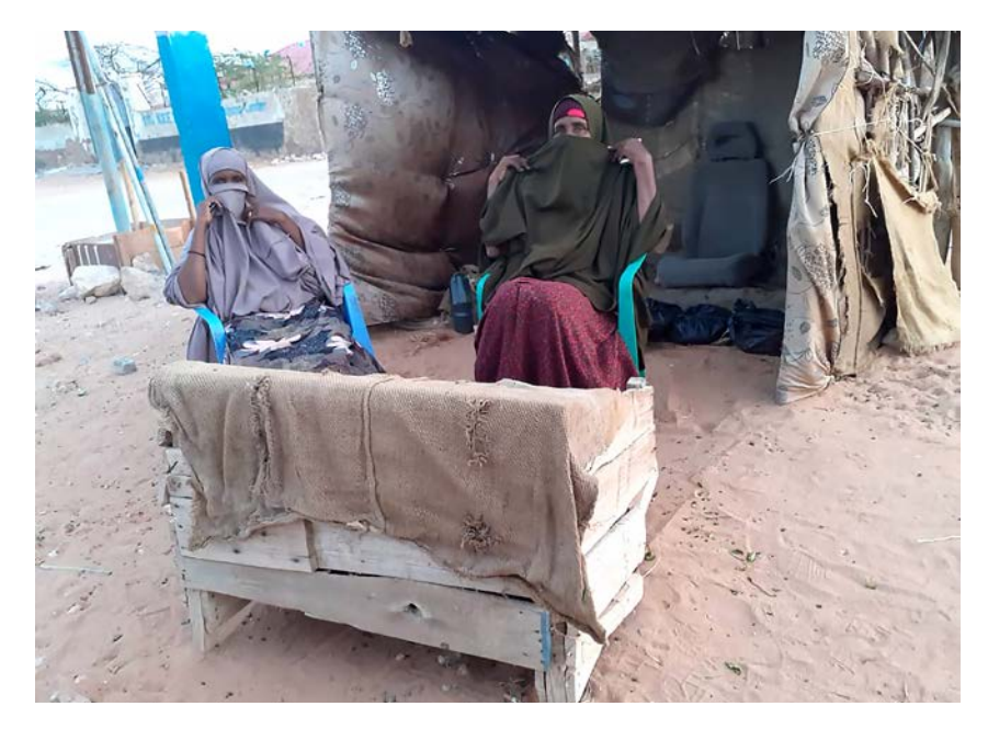
Women khat sellers at a stall in Galkayo.