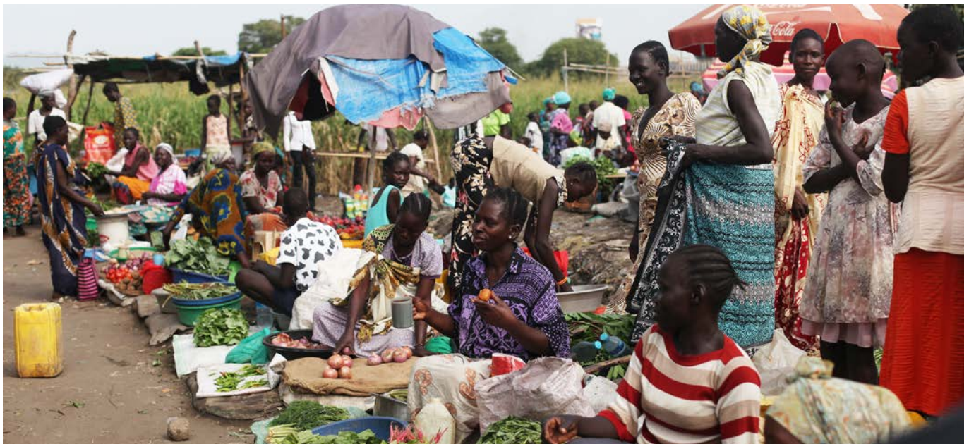
Women in the vegetables market in Gudele, Juba, South Sudan.

2020, 45.2 per cent of the population faced crisis or worse-than-crisis levels of food insecurity, and that figure was projected to rise to 55 per cent between May and July, the pre-harvest dearth. 16