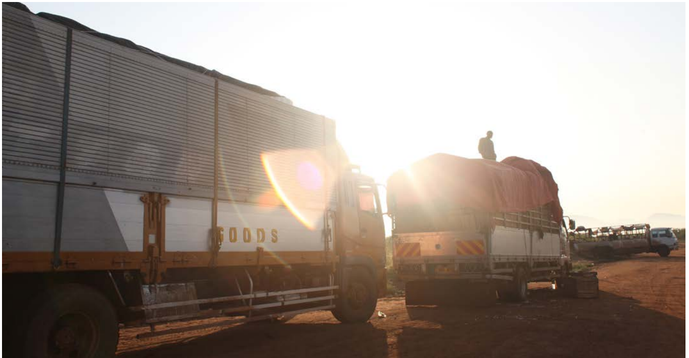
Trucks are waiting in the border in Elegu, Uganda.

The coronavirus pandemic (COVID-19) of 2020 is likely to have profound effects on stressed food systems in already hungry countries. Even before South Sudan reported its first COVID-19 case at the beginning of April, media reports indicated that the pandemic had led to restrictions on the movement of goods from neighbouring countries, which affected prices in markets across the country. 1 In Juba, the price of a kilogram of maize flour increased from 159 South Sudanese Pounds (SSP) in April 2019 to SSP 298 in April 2020. 2 Import volumes have fallen by up to 50 per cent. 3 South Sudan now faces the risk of a protracted pandemic with unpredictable consequences for cereal imports and domestic supplies. 4