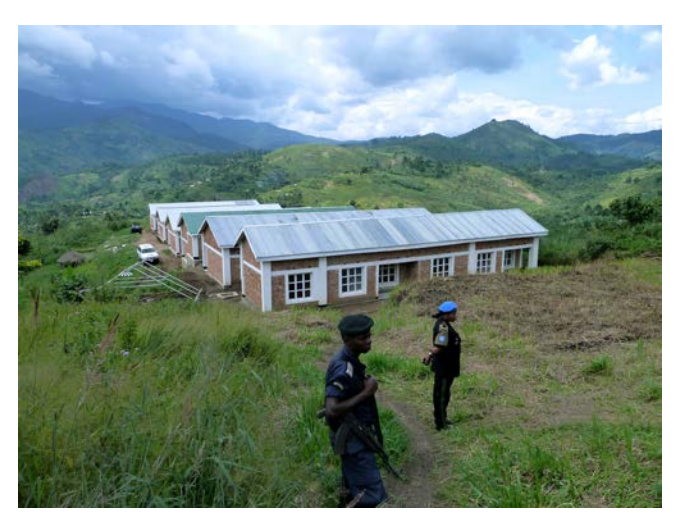
I4S police housing project in Bitale, South Kivu, 2014.

Stabilization has become a buzzword in peacekeeping, with UN missions in such diverse environments as Haiti, the Central African Republic, and Mali all claiming it as their central goal. Few of these missions, however, seem to have a clear understanding of what the concept means in practice.¹ The UN Department of Peacekeeping Operations (DPKO) appears to refer to stabilization as a transitory phase between