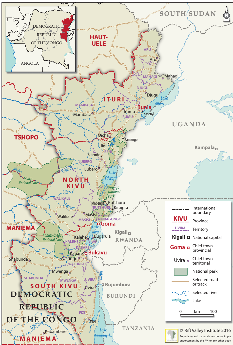
Map. The eastern DRC showing the provinces of Ituri, North Kivu and South Kivu