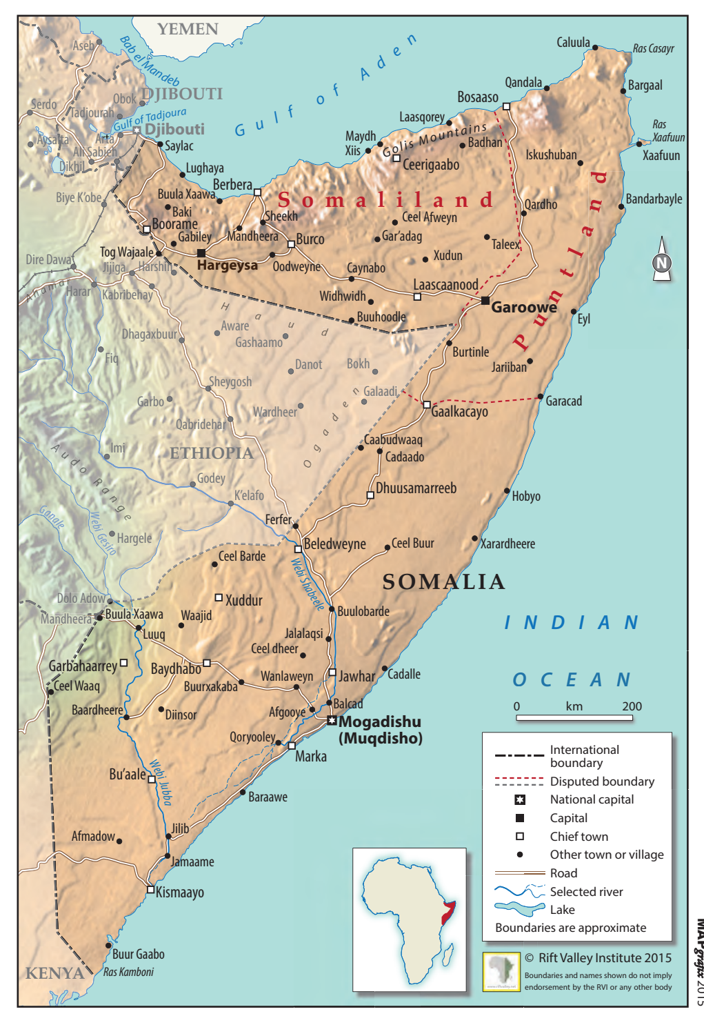
Map 2. Somalia