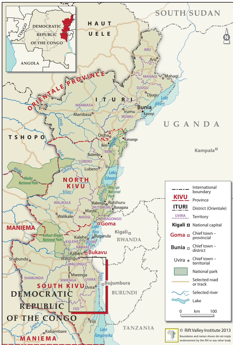
Map 1. The eastern DRC, showing area of detailed map on following page