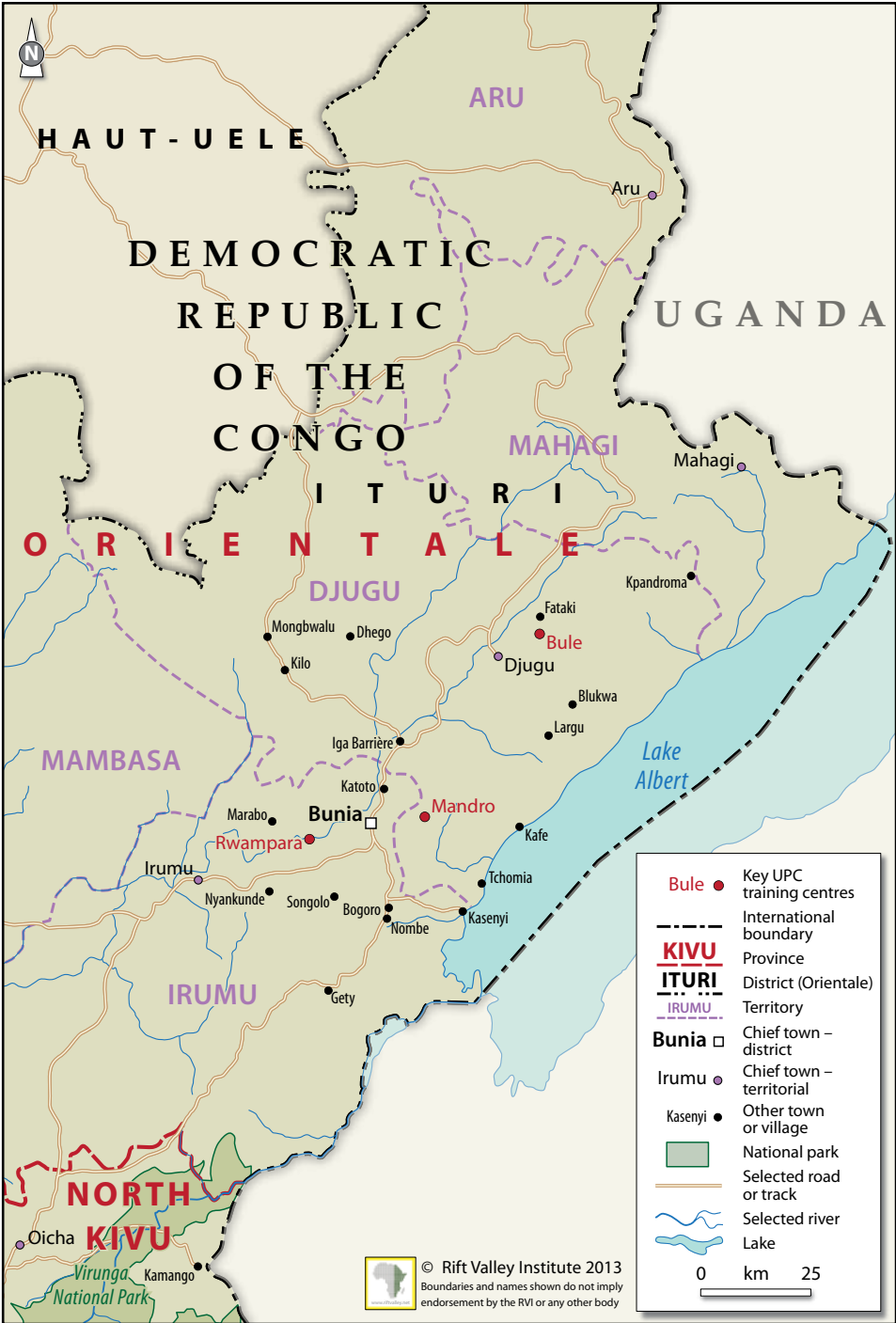
Map 2. Ituri, showing key UPC training centres