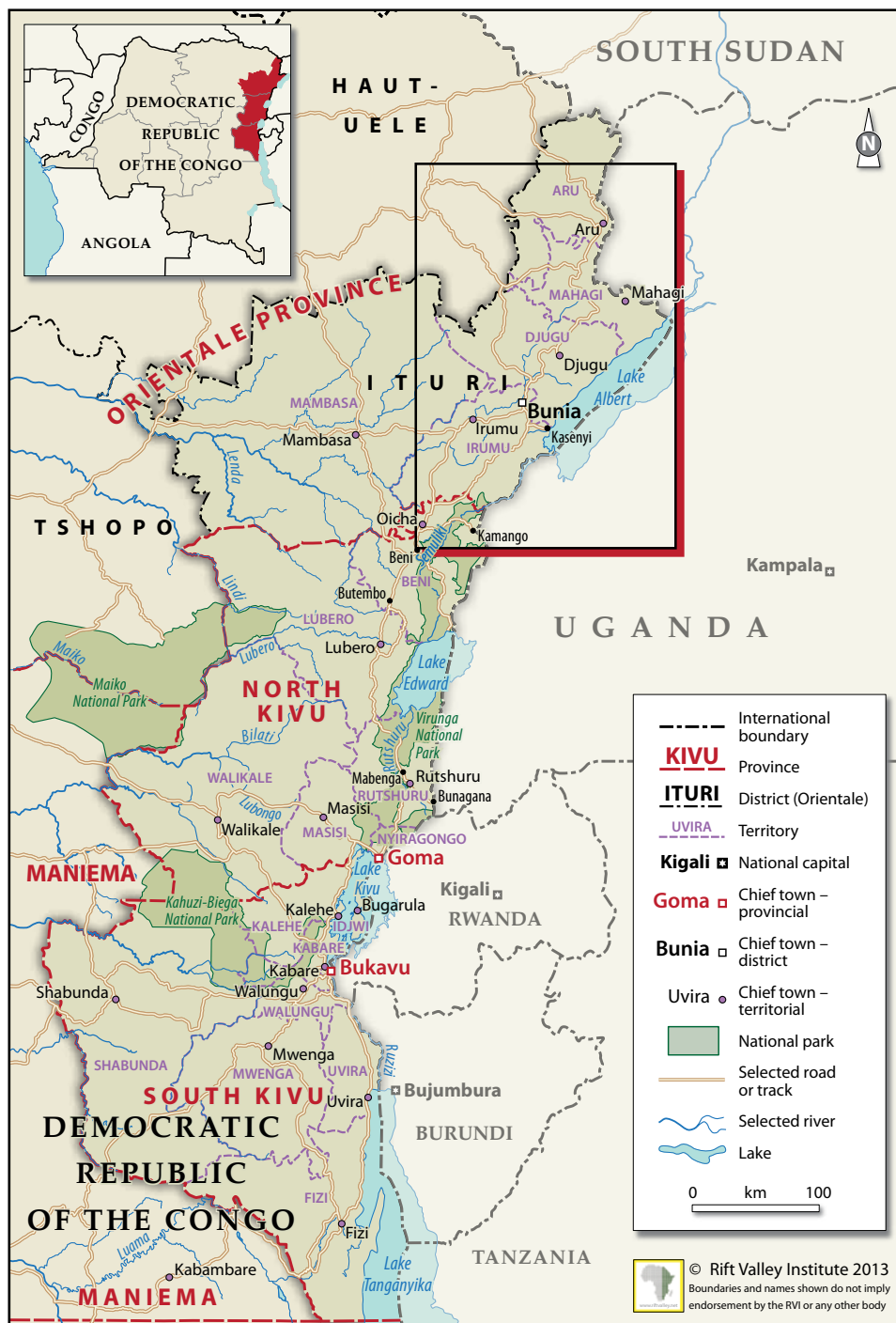
Map 1. The eastern DRC, showing area of detailed map on the following page