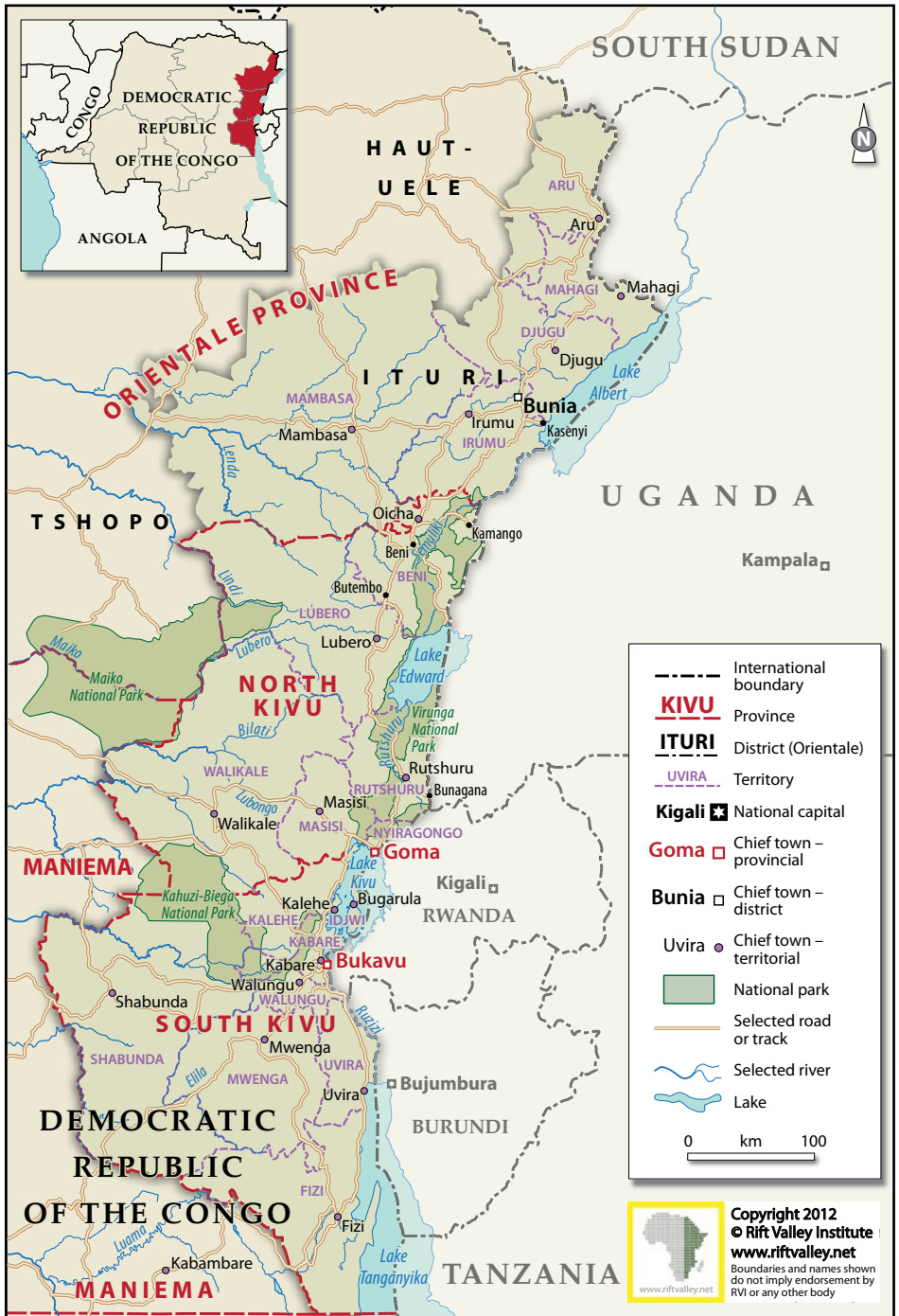
Map 1. The eastern DRC, showing areas covered by the Usalama Project