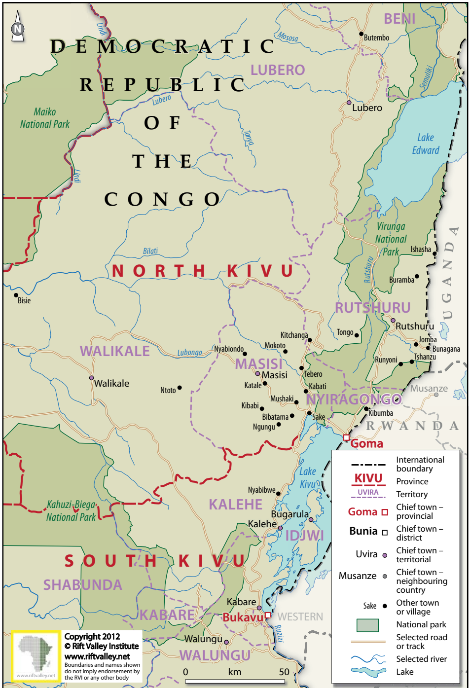
Map 2. North Kivu, showing territories of the Petit Nord