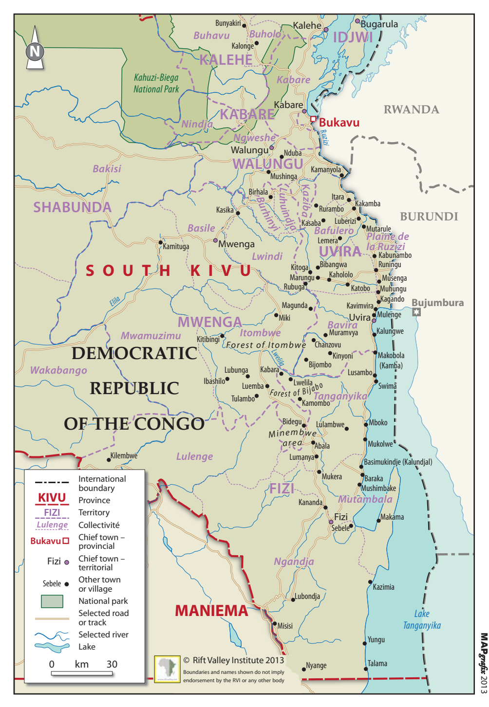
Map 2. South Kivu, showing its territoires, collectivités and main towns