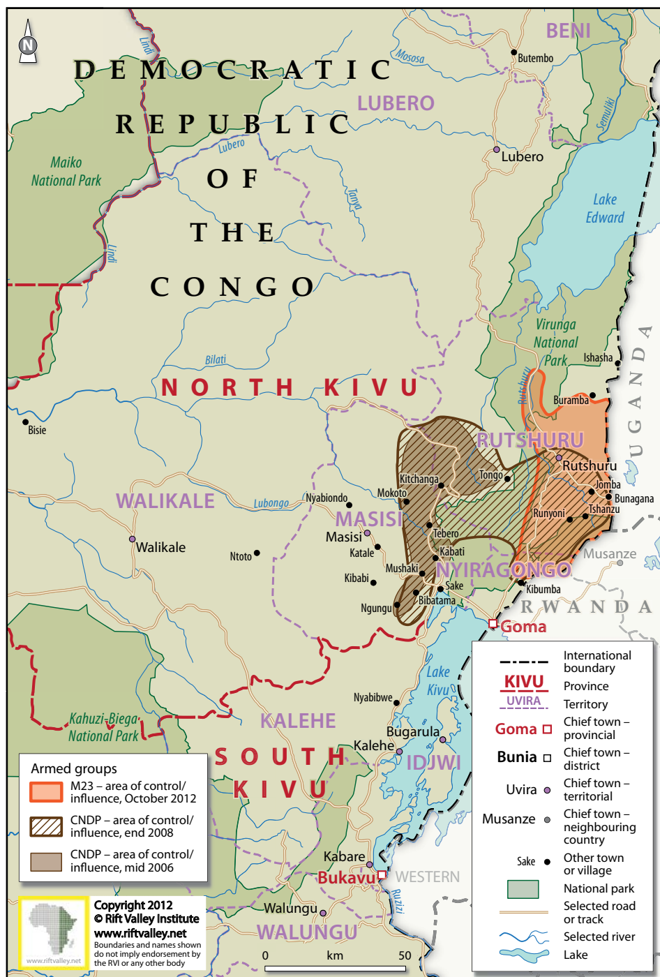
Map 2. North Kivu, showing areas controlled or influenced by CNDP and M23