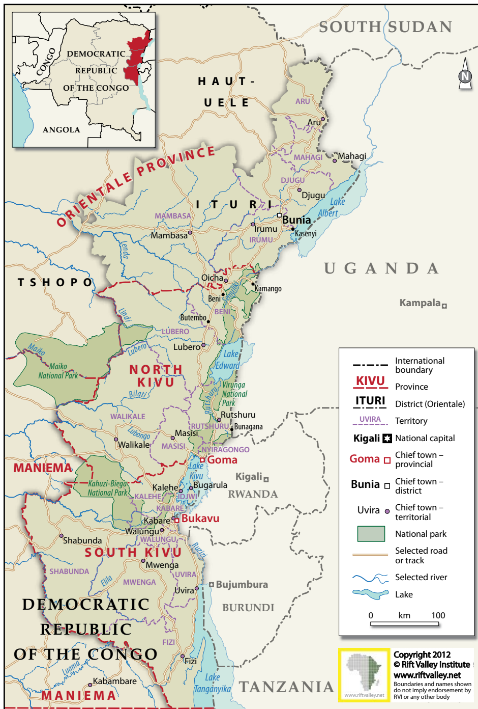
Map 1. The eastern DRC, showing areas covered by the Usalama Project