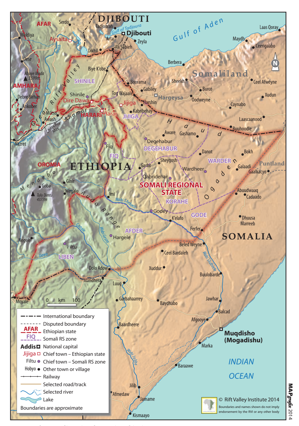
Map 2. The Somali Regional State in Ethiopia