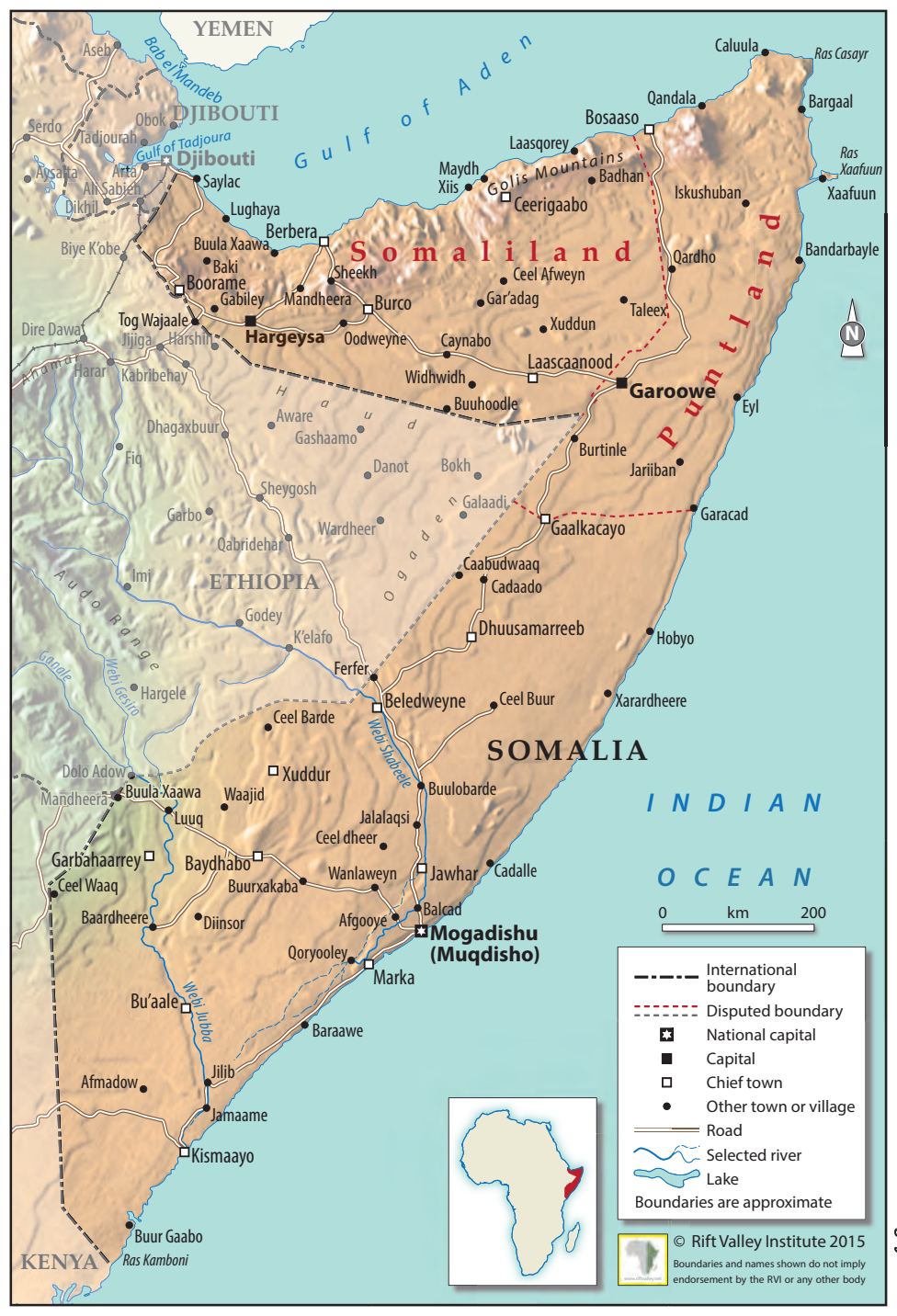
Map 1. Somalia